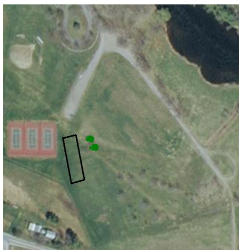
Satellite Overview Of Manson Park With Proposed Marketplace Tent Outline

The Central Maine Egg Festival - the Craft Tent has been transformed into the Egg Festival Marketplace .